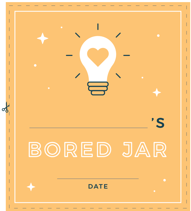
Large label 3.5" x 4"