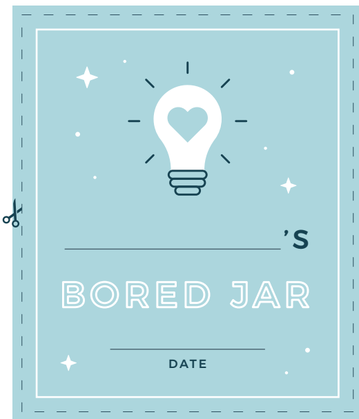
Small label 2.5" x 3"