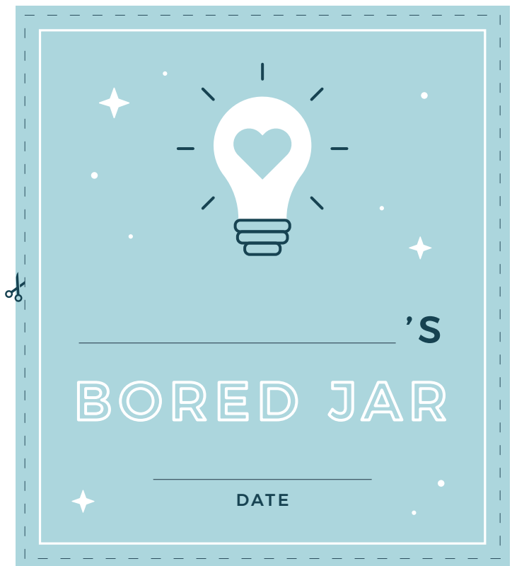
Large label 3.5" x 4"