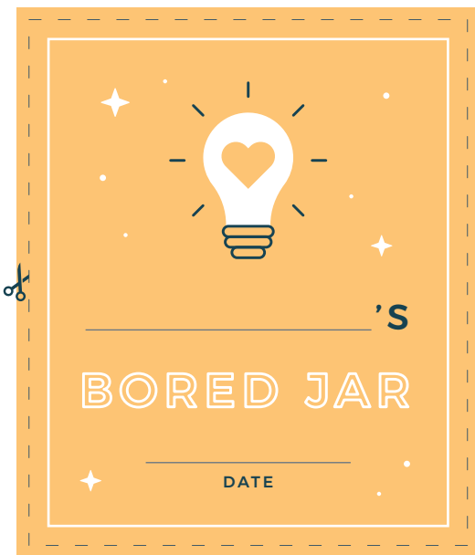
Small label 2.5" x 3"

Fill in your name and the date your bored jar was created, then fill with fun activities!